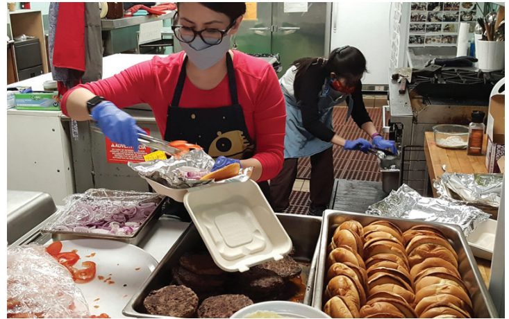
Assembling the meal boxes