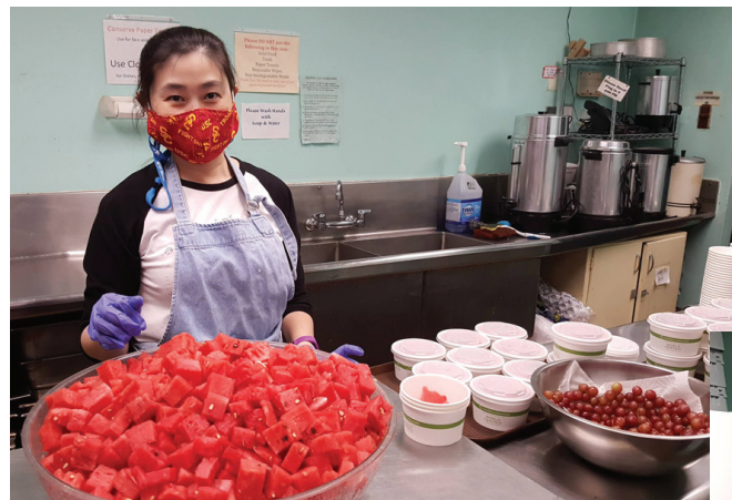
Making watermelon bowls