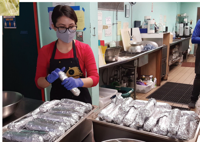
Foiling corn before baking