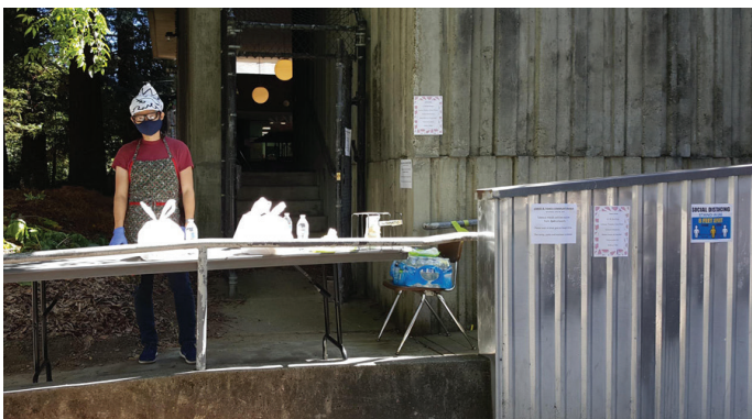
Meals & beverages ready for our guests at 2pm