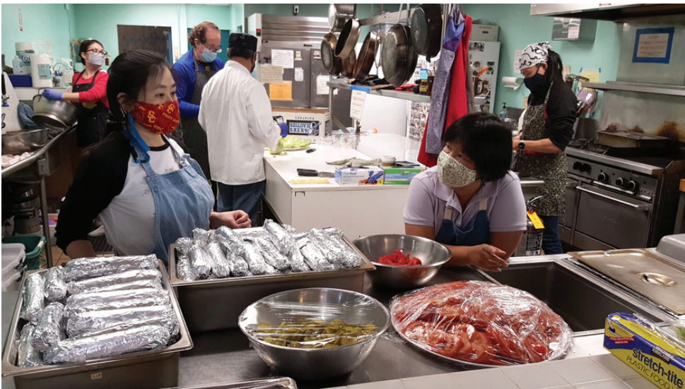
Socializing with distancing