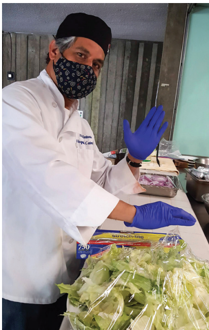
Lettuce make you laugh